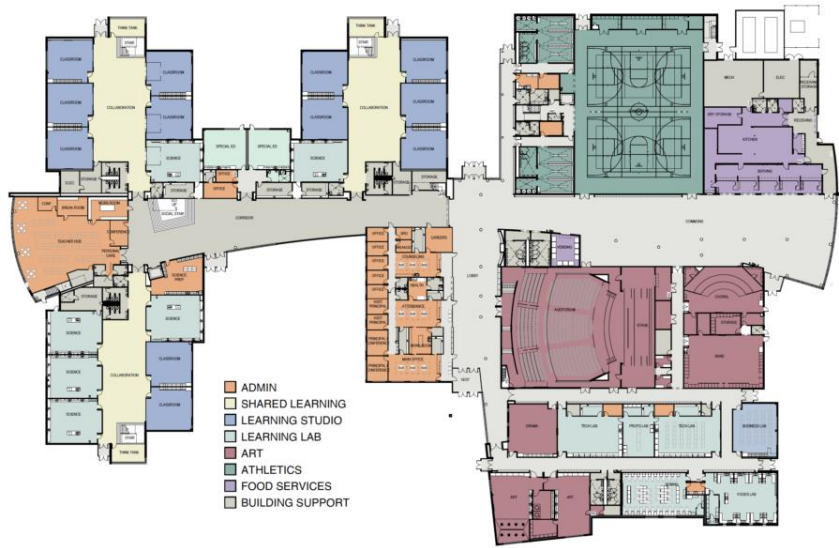
Sample Floor Plan (First Floor)