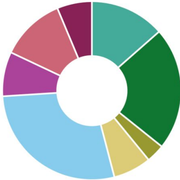
FY23-24 Sources - $23.46B